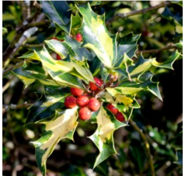
Ilex aquifolium 'Harlequin' from the Elmore Holly Collection.