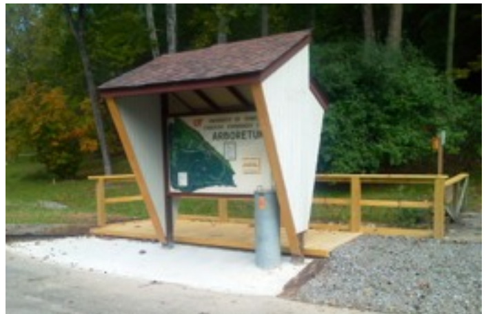
As good as new kiosk in the parking lot.

Kevin Hoyt and his crew have worked hard to spruce up the kiosk that was removed when the parking lot was paved. It now sits at the edge of the parking area and offers improved access to all visitors. A little detail work remains to be done, but it looks almost brand new. They have installed a secure donation tube, so drop a little in when you stop by to look at it. Thanks to all those who worked to bring back the kiosk.