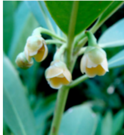
Yellow Anise flowers.

The shrub is Yellow Anise ( Illicium parviflorum ), which is a species native to Central Florida. Although unrelated to the Aniseed