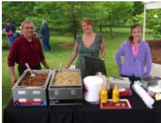
Razzleberry's delicious food and ice cream!

Society members who work at the sale have the opportunity to get to know other members