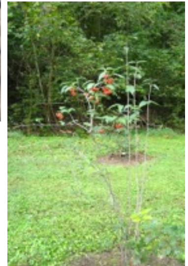
Tea Viburnum (V. setigerum), part of the Viburnum Valley Project.