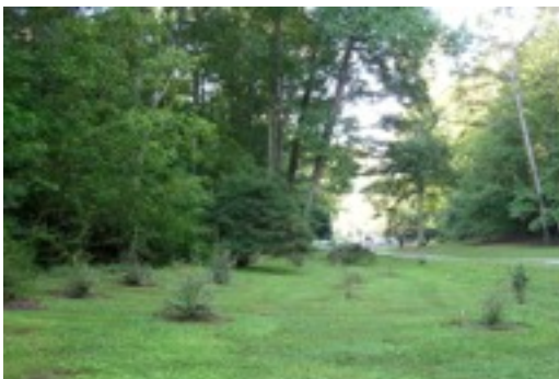
A view of the 2011 viburnum plantings from the Oak Hickory bridge toward the Visitors Center.

The Viburnum Valley project is moving into its final phase. The UTAS board has authorized the purchase of 28 new plants for the valley, and we have located mostly local sources for all chosen cultivars. We are so fortunate that several of our loyal plant sale vendors have donated