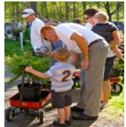
Selecting plants is fun for all ages.

Remember: we accept only cash or checks.