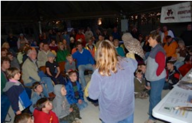
A rapt audience in the presence of a nocturnal raptor at a previous Owl Prowl.

Come out to the Arboretum for an evening of family fun and learning. This is an opportunity to see owls up close, and to take a short walk through the grounds at night to perhaps hear owls prowling about and calling out to you. Katie Cottrell and Kathy Strunk of the Clinch River Raptor Center will bring owls from the Center and will share some of their knowledge about these nocturnal raptors.