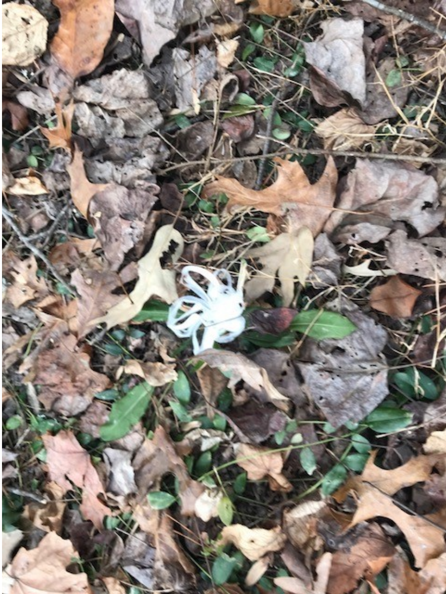
Frost Flower – Image taken by Tim Bigelow on New Years Day Hike