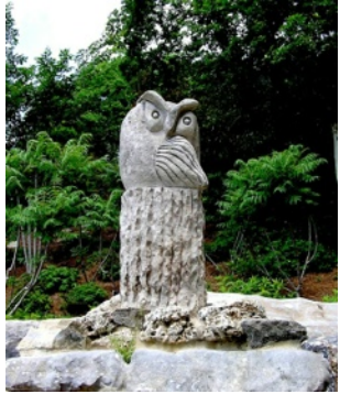
Cheekwood has the first garden in Tennessee to This solemn owl watches over be recognized as a member by the North American Plant Collection Consortium for the variety the Sigourney Cheek Literary and heavy of its dogwood collection 14 species and 24 gultivated varieties! There wasn't

and beauty of its dogwood collection—14 species and 24 cultivated varieties! There wasn't time to see everything before our elegant lunch at the Pineapple Room , complete with an orchid on every plate. ( Continues on page 3 )