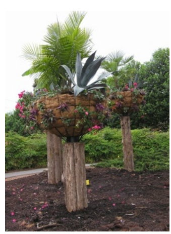
Creative use of plants and materials, Huntsville Garden.

We only had time to visit the Bactrian camels, shown here with Don, which charmed everyone with their heavy coats and long eyelashes. Look for "All Things Acer" at <u>http://www.shadownursery.com/</u>, for a more detailed overview of the maples and the nursery.