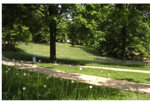
Cheekwood: preparations for the "Field of Light," part of the Bruce Munro "Light" display.

In May, the Cheekwood staff were in the middle of "swapping-out" time-the changeover from spring bulb displays to