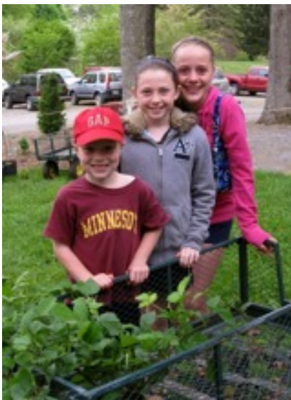
Getting off to a good gardening start, they help pick out plants they like. Come on out and choose your own!

Check the mailing label for your membership expiration date.