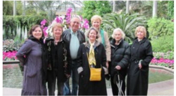
Orchids and Tour Members at Longwood Gardens

represented on the walls of this original Albert C. Barnes house. It and 12-acre arboretum were bought in 1925 in Merion, Pennsylvania. Our group was fortunate to visit this original gallery, as it will close its doors forever when relocated to Center City Philadelphia in 2012.