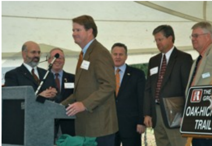
The Rogers Group announces its Endowment Pledge of $500,000 in the fall of 2006. Anyone spot a familiar face on the far left?

The Arboretum is fortunate to have a neighbor like The Rogers Group that values the Forest Resources Research Center and the Arboretum for their beauty and contributions to the ecological heritage of the area. The University of Tennessee Institute of Agriculture needs neighbors such as The Rogers Group that understand the research, education, and outreach mission of our programs and invest in our future. We have named a trail at the Arboretum to honor The Rogers Group's generous gift, and it demonstrates that we have partners in securing our future. When you see representatives of The Rogers Group, please thank them on behalf of the Arboretum. As we progress in our efforts to expand programs and facilities at the Arboretum, it would be great to continue to recognize the leadership of their company