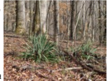
'Yucca filiformis' Along the Rock Pile Lead Trail

Yucca belongs to the plant family Agavaceae (though some botanists assign it to the Liliaceae ). There are 40-50 members of this genus, many growing in arid desert to semi-desert climates. The UT Herbarium web page lists two species of Yucca present in our area – Yucca filamentosa and Y. flaccida – both commonly called Adam's Needle. Some botanists consider these both to be Yucca filamentosa . These