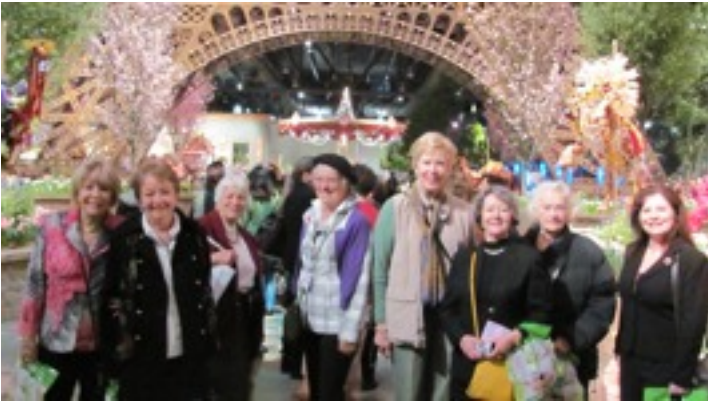
Is this Paris, or the Philadelphia International Flower Show? Only our Tour Participants know for sure!

University of Tennessee Arboretum Society 2011 tour members, eager to get a head start on spring in early March, met in Philadelphia for this year's UTAS tour. Arriving early for a private VIP tour, we stepped from one continent to another as we entered the 2011 Philadelphia International Flower Show . A stunning Parisian park filled with an allée of Cherry and Zelkova trees and blooming flowerbeds greeted us. The garden, planted in an Art Nouveau design, provided a luxurious setting for the 33-foot tall replica of the Eiffel Tower. From the 25,000 blooming tulips to the ubiquitous