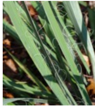
'Yucca filiformis' Threads

In summer Yucca produce a tall stalk (3-8 feet high) with showy, creamy white flowers. Yucca depends on a moth for pollination, while the moth requires the Yucca as a site for raising its larvae, a classical example of mutualism. The female moth collects pollen balls from the anthers of a Yucca flower, which she then transfers to another flower. At the same time, she deposits one or more fertilized eggs into the plant's ovule. As the moth larva develops, it feeds upon the Yucca seeds. Maybe we'll see some of these moths at Kris Light's workshop!