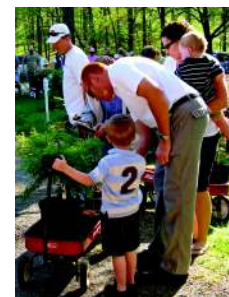
Maybe he'll help dig the hole, too.

landscapes all over Oak Ridge and the surrounding area. Our other major vendors, Beaver Creek Nursery, East Fork Nursery, and Sunlight Gardens , offered an excellent selection of perennials, shrubs and other plants. One of the reasons people love our sale is that year after year we offer quality plants, many of which are rare or difficult to find, at reasonable prices. We appreciate everyone who came out to support UTAS, the UT Arboretum, and our local vendors.