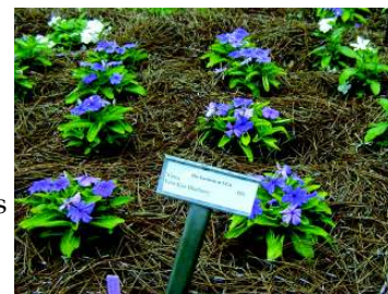
Pucker Up - It's 'First Kiss Blueberry' Vinca Catharanthus roseus 'First Kiss Blueberry'