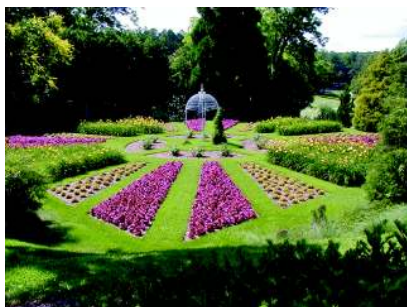
Quite an array of lovely plants at the Ray Garden, Hills and Dales