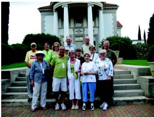
The Front Entrance to 'Hills and Dales'

a tour of the house with its original furnishings, bought by the Calloways on a shopping extravaganza in Europe. The house itself is a beautiful Italian Villa sitting on the