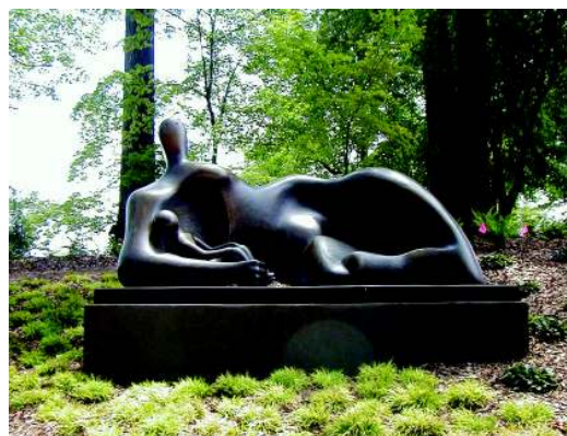
'Reclining Mother and Child' by Henry Moore

We spent the afternoon exploring the Atlanta Botanical Gardens in the heart of midtown Atlanta on our way to Calloway Gardens. How delightful! From the shady woodland with its cool fern glade, to the Japanese garden, to the fragrant rose garden, to the blooms of the Hydrangea Collection in peak bloom in late May and June - these gardens had it all. A special exhibit there of the Henry Moore in