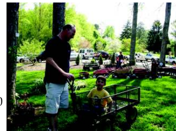
Happy to be Outdoors with Dad