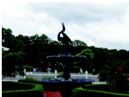
Egret Fountain, Georgia Botanical Garden

Colorful flowers, theme gardens, majestic trees, and a three-story tropical conservatory all contribute to the fascination of the State Botanical Garden of Georgia in Athens. This garden, under the auspices of the University of Georgia, offered an afternoon delight following our day of travel. Here,