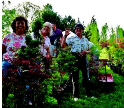
Shop 'Til You Drop - Maples Galore!