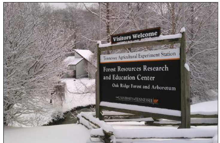
Winter Wonderland Welcome at the UT Arboretum.

'Reasons abound for season's turnaround Morning light, misty and bright Gentle breeze, soft and light Stream gently through leafless branch Dewdrops ablaze in morning sun Resemble glittering lights of Christmas bright Snow in the glade resting in shade Holly berries delight With sight of sun's perfect light Red and Gold dance on backdrop of green and white Winter's Solstice not far behind Trees barren of leaves prepare for winters rest An abandoned nest, Evidence of new life. A blanket of snow on frozen ground, Shelter spring bulbs, Await season's turnaround.