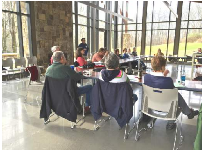
UTAS Board retreat in the beautiful new Auditorium.