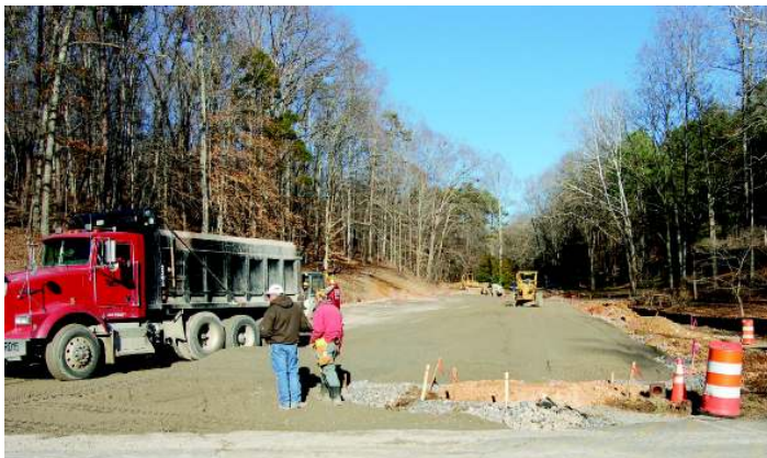
The new parking area nears completion