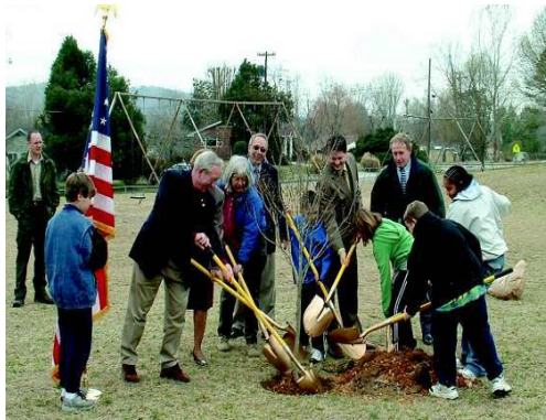
Into the ground goes a pink dogwood.