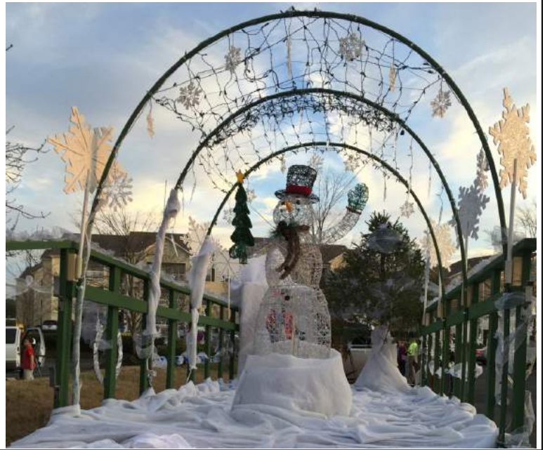
Image : 2015 UTAS Parade Float. More images of the 2015 float and helpers can be seen in the online issue.

Volunteers will be needed to help plan, build, and decorate the float. If you would like to help out, please contact Lynda Haynes at 483-0525, lyndaandchuck@bellsouth.net .