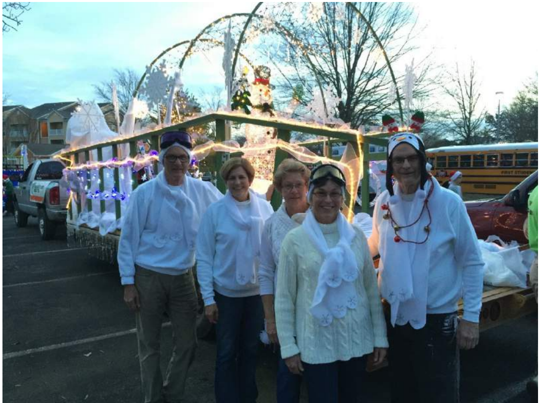
Images from 2015 Christmas Parade