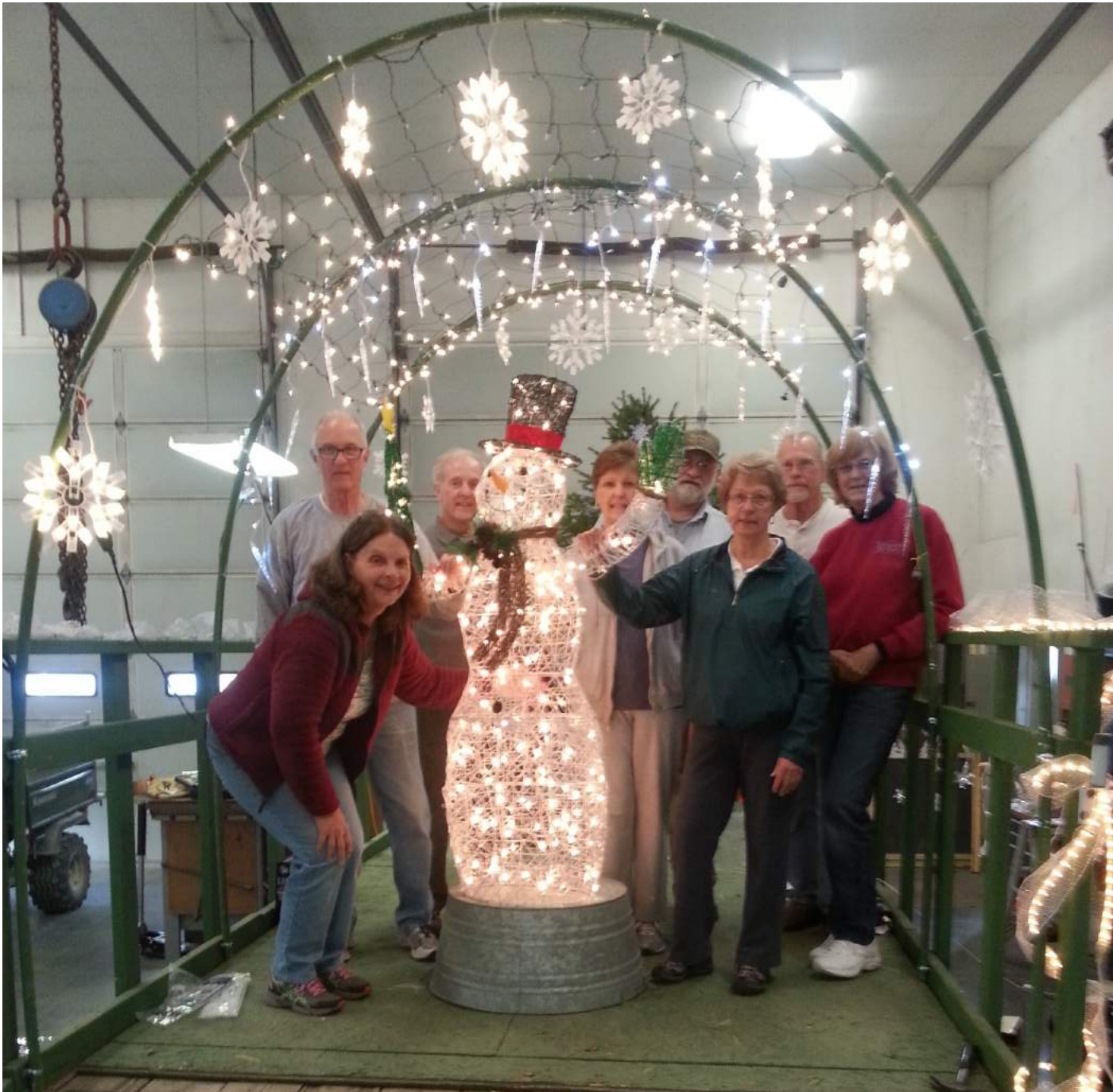
Image of the UTAS 2015 Christmas Float