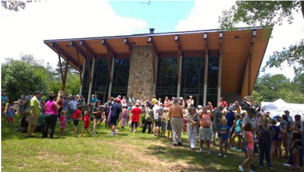
Image: butterfly release