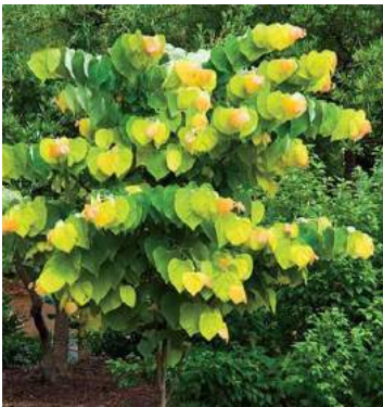
Image of Rising Sun