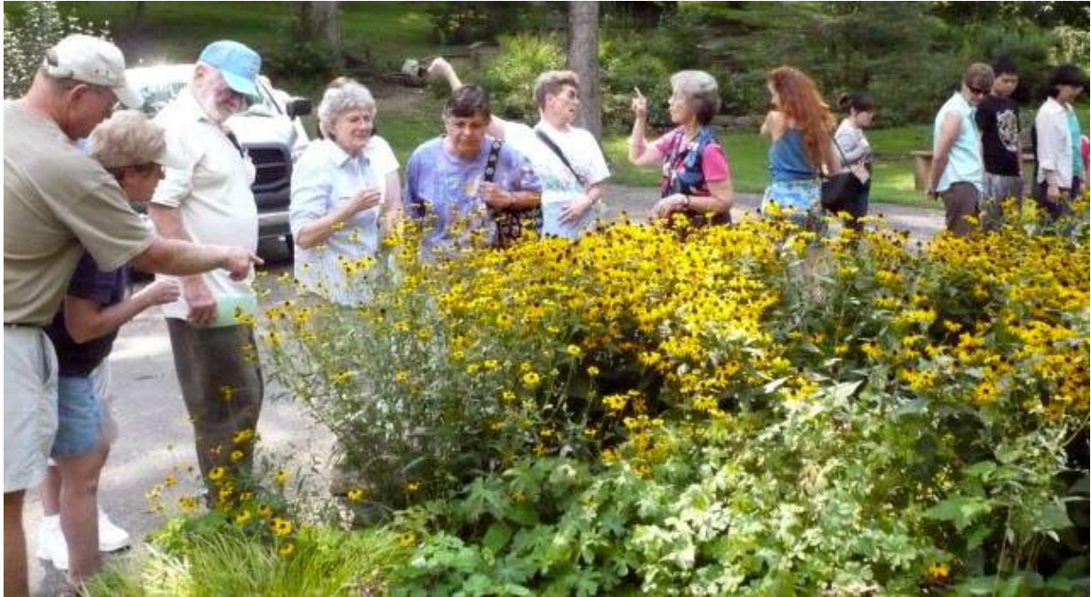
Images from the July Butterfly Festival