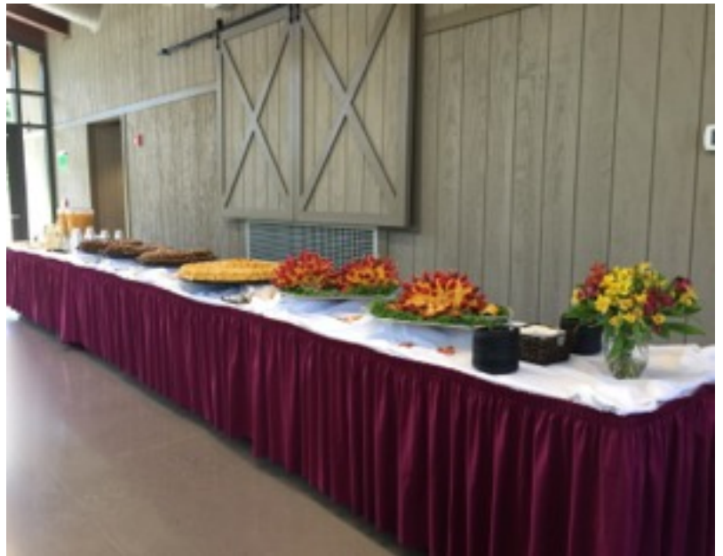
The DoubleTree Hotel in Oak Ridge provided this lovely array of nibbles for the auditorium Open House.