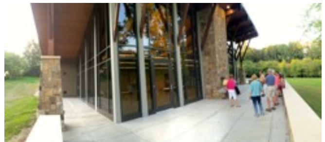
View of the auditorium's patio with its outdoor fireplace.