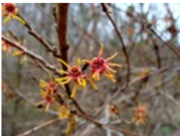
Vernal Witch Hazel ( Hamamelis vernalis )

Email questions about trees, woody plants, or wildlife to our Green Thumb experts at utarboretumsociety@gmail.com .