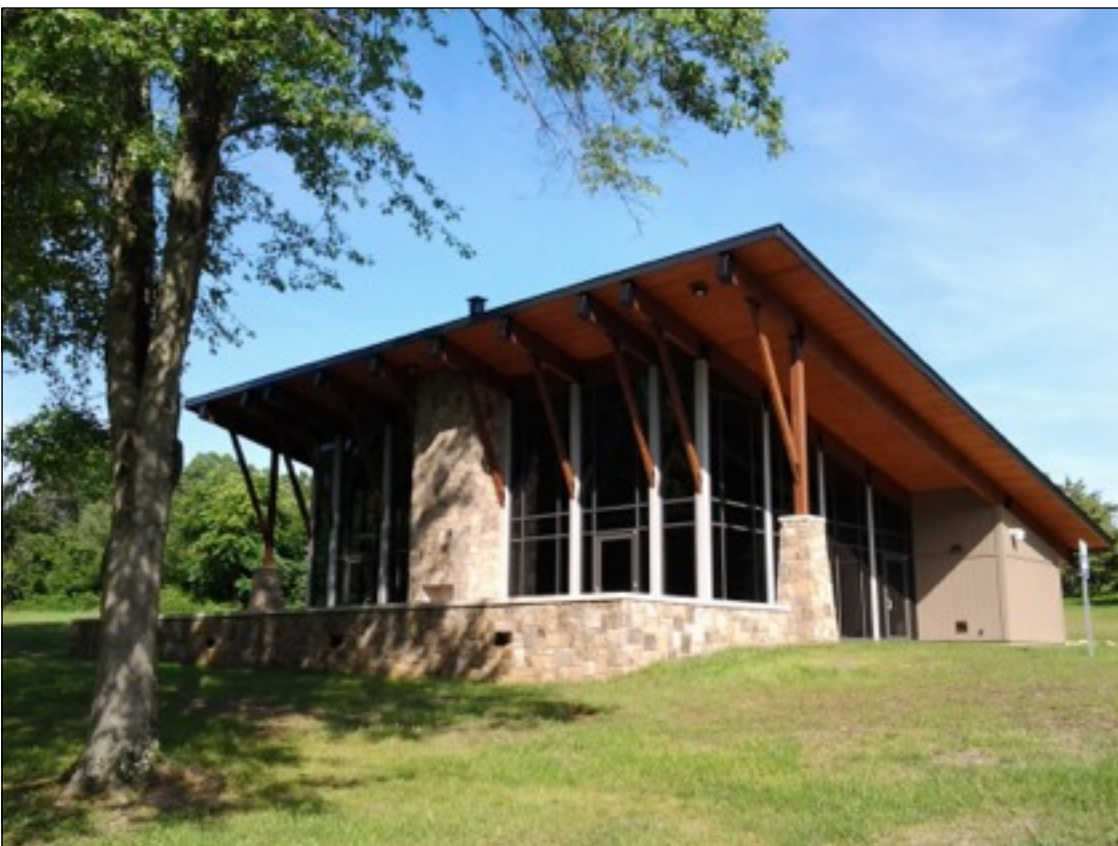
The UT Arboretum Auditorium

After nearly a year of construction, and many more years of planning, the new Arboretum auditorium is finished.