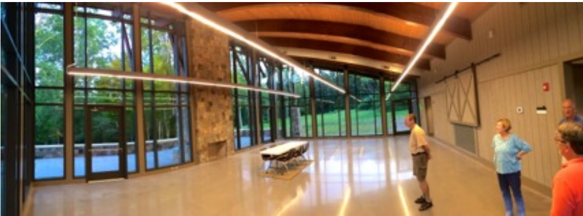
The UTA Auditorium interior