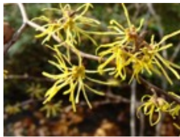
American Witch Hazel ( Hamamelis virginiana)