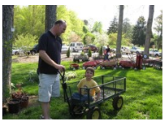
Ready for shopping and learning about plants at the UTAS Plant Sale