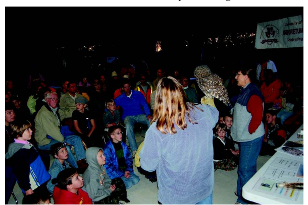
This owl can't prowl, but children of all ages are rapt at seeing this raptor.

children and adults who came out to learn more about them. Not all the shivers were from the cold as night noises filled the air.