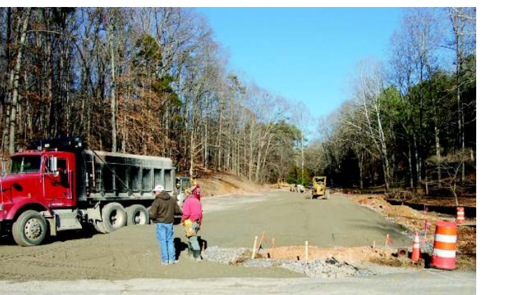
The new parking area nears completion