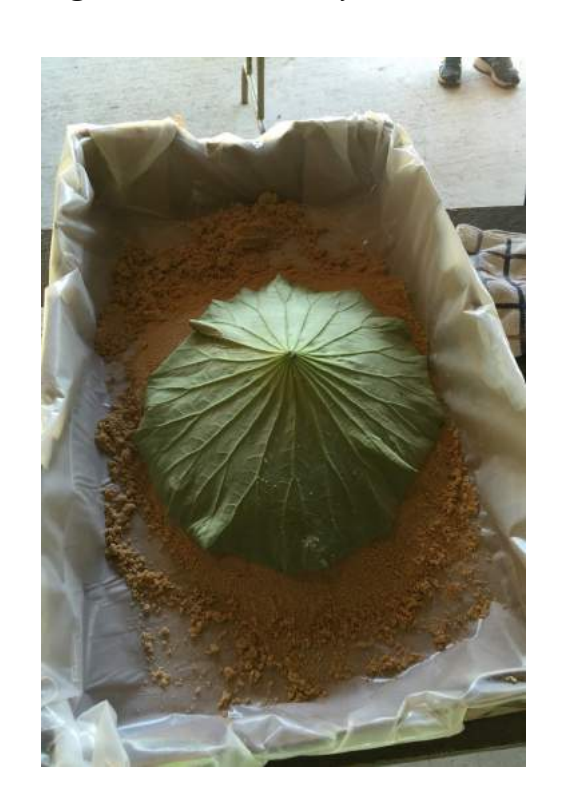
August Cement Craft Event