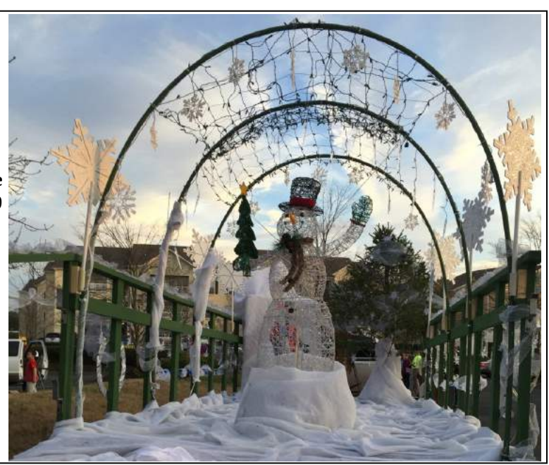
Image : 2015 UTAS Parade Float. More images of the 2015 float and helpers can be seen in the online issue.

Volunteers will be needed to help plan, build, and decorate the float. If you would like to help out, please contact Lynda Haynes at 483-0525, lyndaandchuck@bellsouth.net.