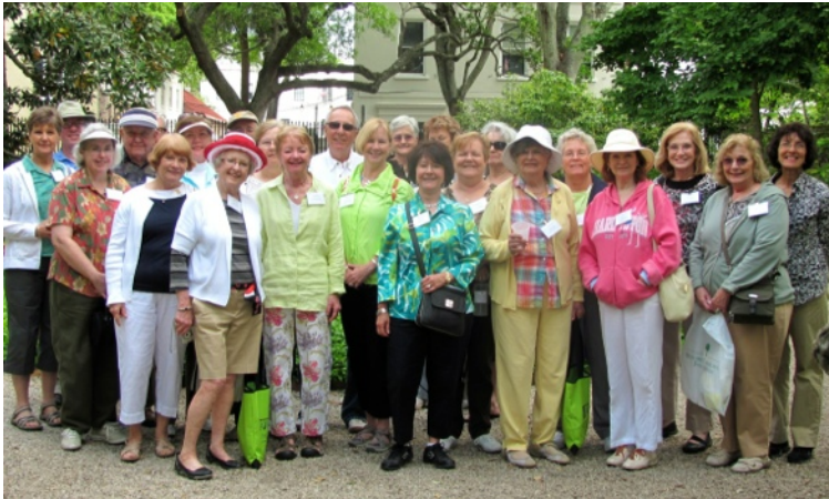
The 2012 Tour Group in Charleston