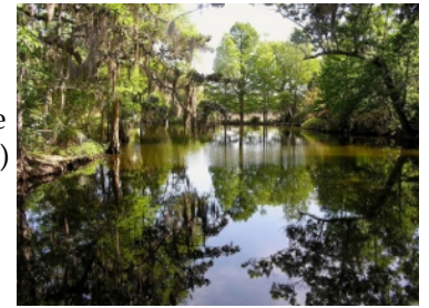
The Swamp at Magnolia Plantation

from another site, predate the Revolutionary War. However, the gardens, in the 'romantic' style, escaped destruction, and some portions are over 300 years old. Of particular note are the acres of "ancient" (pre-1900) camellia varieties—over 1000 cultivars of C. japonica alone. Peak bloom is usually in April; this year it was much earlier, but some blossoms lingered in the cool shade.