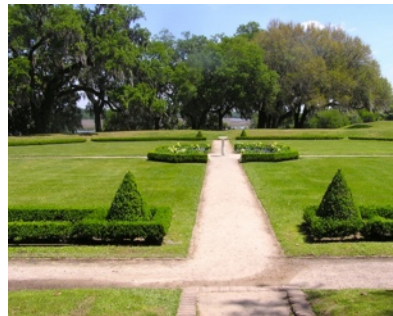
The Octagon Garden at Middleton Place

The group spent the morning at Magnolia Plantation on a tram