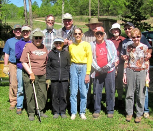
A Dedicated Group of Volunteers After Cleaning up the Elmore Holly Collection

P.O. Box 5382 Oak Ridge, TN 37831-5382 RETURN SERVICE REQUESTED