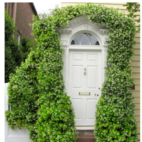
A classic front door, surrounded with Confederate Jessamine, on a Charleston home.