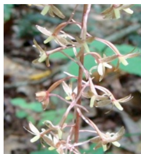
Cranefly Orchid Bloom

According to the Arboretum website, http://forestry.tennessee.edu/featuredplantsjuly.htm , "If you look carefully along a number of our Arboretum trails, you may be fortunate enough to see an