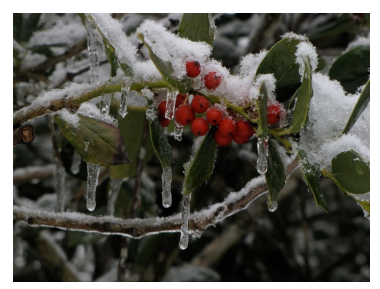
Elmore Holly Collection: Holly Berries in Ice - Photo by Charles Samuels and used on the cover of the Holly Society Journal.

According to the Featured Plants page on the Arboretum website, http://forestry.tennessee.edu/ featuredplantsjan.htm, Vernal Witch Hazel (Hamamelis vernalis) blooms in January near the creek below the Visitor's Center. Vernal Witch Hazel, "...is a native of the Ozark and Ouitchita Mountains. Its very fragrant flowers vary in color from yellow to purplish-red and usually bloom in January or February. The common name Witch Hazel purportedly comes from the belief that witchcraft allowed the crooked stems of the shrub to be used for divining water. The flowers of our native American Witch Hazel (Hamamelis virginiana) have 4 yellow strap-shaped petals and are less showy than those of Vernal Witch Hazel. Witch Hazel belongs to the plant family Hamamelidaceae . The only other genus in this family native to the U.S. is Sweetgum (Liquidambar)." You can also find colorful berries on the Flowering Dogwood (Cornus florida), Oriental Bittersweet (Celastrus orbiculatus), and Amur Honeysuckle (Lonicera maackii). Of course, the Elmore Holly Collection is simply brimming with berries. So take a walk out at the Arboretum - being outdoors and seeing the winter colors will cheer you up!