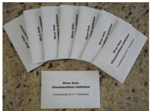
River Oats seeds harvested by the Native Plant Group from the beds around the Arboretum Visitor's Center.

The Native Plant Group collected dried seed heads from plants before they prepared the Arboretum's Visitor Center beds for winter by cutting back the perennials. After a thorough drying, the seeds were separated from the chaff and packaged for distribution.