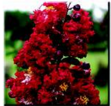
Dynamite, the first Whitcomb introduction, has true red blooms, typically lasting 120 days, on an upright plant.

Most of the newer varieties are repeat bloomers, which means that you don't even need to prune the tips. The blooms last a very long time - up to 120 days or more! Many flower clusters are very