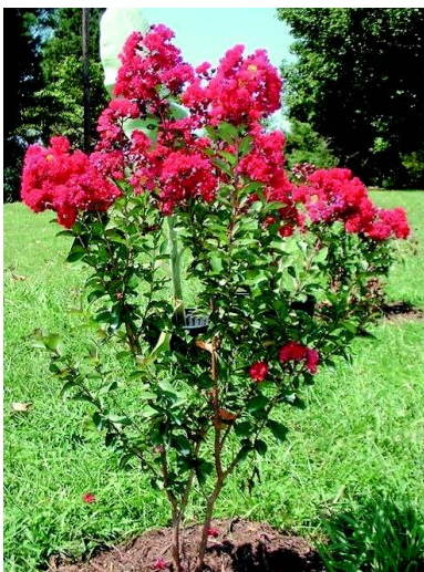
Red Rocket is the fastest-growing Whitcomb, with flower clusters up to 24" long.