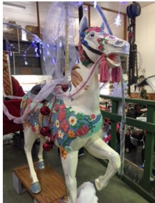
Image: Kathy F. loaned this beautiful carousel horse that she painted/restored to UTAS for the float.