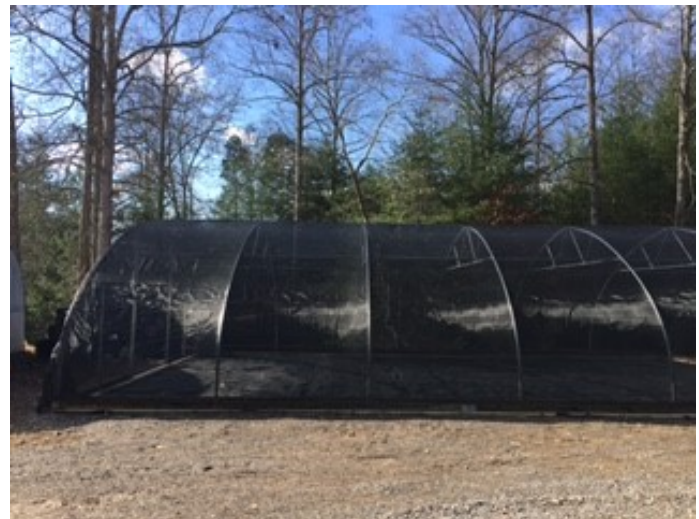
New UT Arboretum shade house.